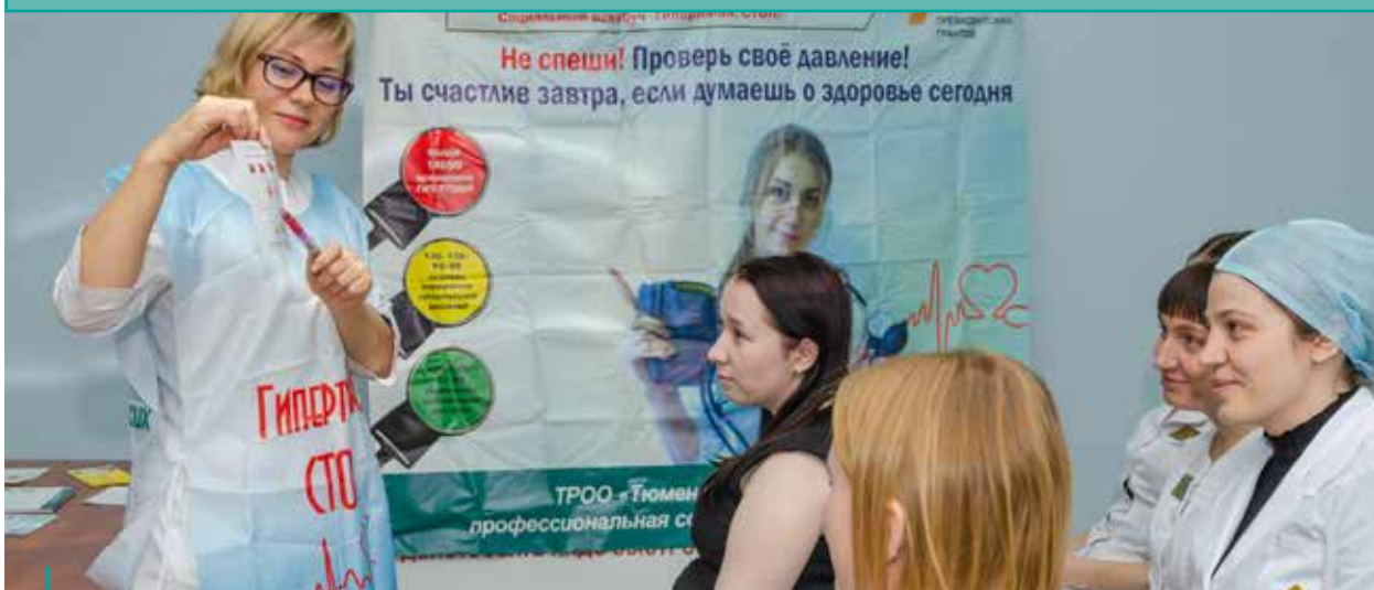
Tyumen Regional Nurses Association, Russia.